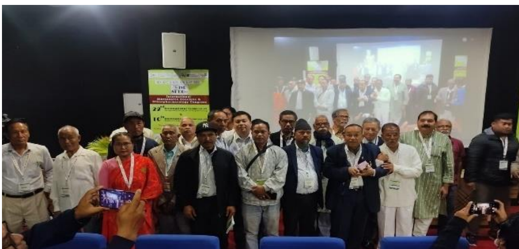
Figure 2.6 Traditional Healers’ Conclave during the ISE SFEC 2023