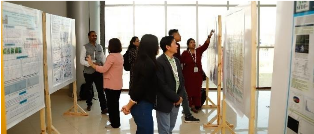
Figure 2.3 Poster presentation during ISESFEC 2023