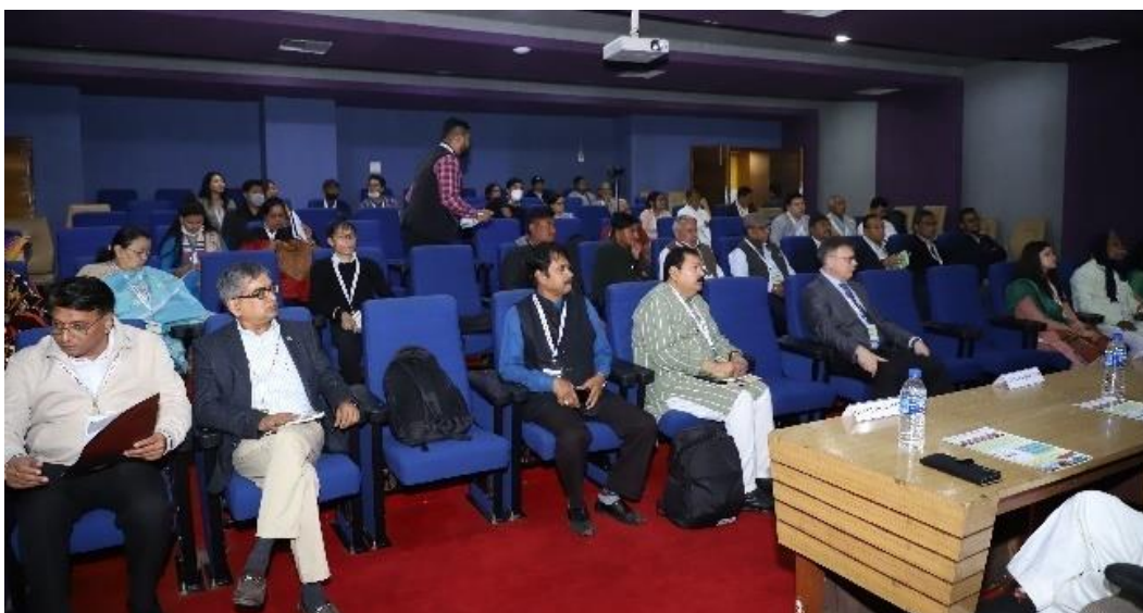
Figure 2. 5 Participants attending the Traditional Healers’ Conclave during ISE-SFEC 2023