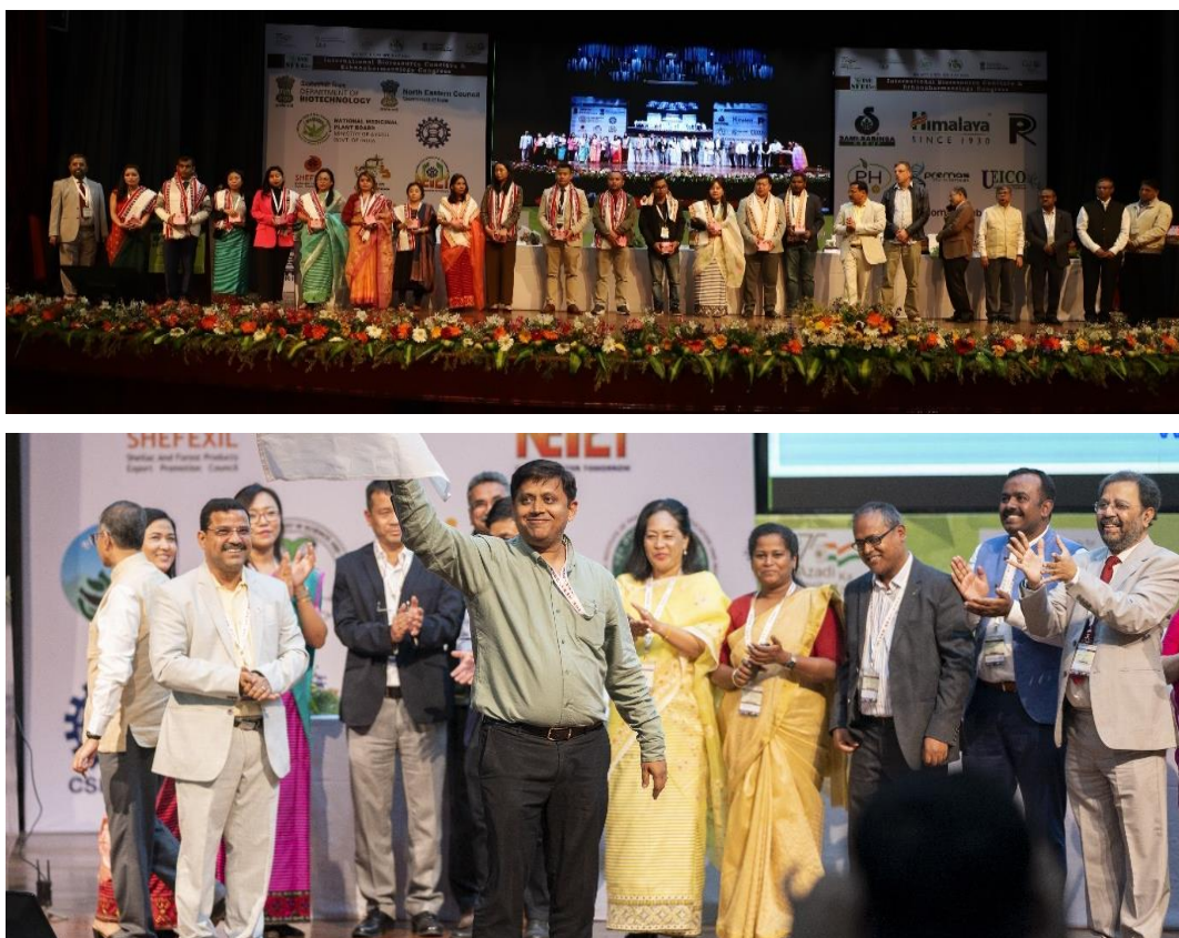
Figure 2.7 Valedictory Session of ISE SFEC 2023 on 26.02.2023 at Imphal, India

The conference provided an ideal platform to the participants to present their research work, interact, discuss and disseminate ideas amongst the distinguished professionals, eminent technologists, industrialists and traditional health care professionals. All the participants had a wonderful and fruitful learning experience during these three days' mega events and our organising team received overwhelming feedback from everyone. At the end it was announced that the next international congress of Society for Ethnopharmacology (SFE) will be hosted by the Jammu Local Chapter of society for Ethnopharmacology during February 16-18, 2024.