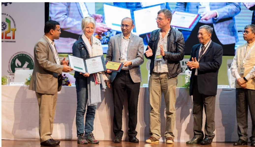
Figure 2.1 Annual award ceremony during the ISESFEC 2023