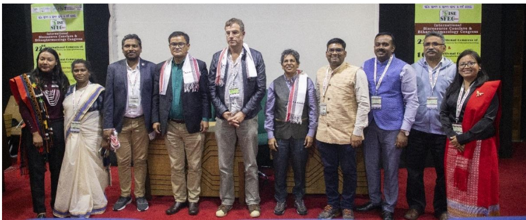
Figure 2.4 Oral Presentation during ISESFEC 2023