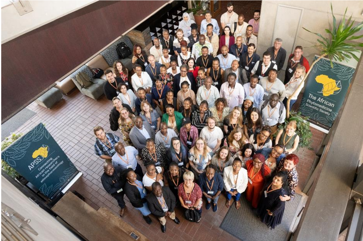
Figure 5.1 Attendees of the 1 st International Congress of the African Phytomedicine Scientific Society

Highlights of the congress included engaging panel sessions, interactive workshops, virtual and in-person oral presentations as well as numerous poster presentations that showcased ground-breaking research. The vibrant atmosphere fostered networking opportunities, enabling participants to forge new connections and strengthen existing collaborations.