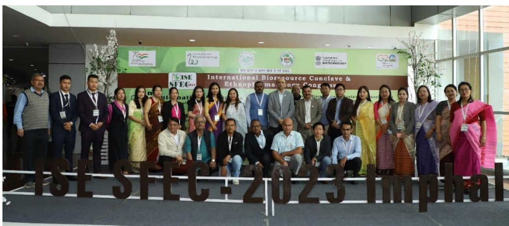
Figure 2.2 Organizing committee of ISESFEC 2023