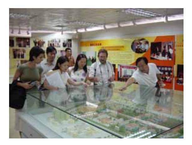
Visit to Guangxi Traditional Chinese Medical University

More and constantly updated information about the conference will soon be available on the society's homepage (www.ethnopharmacology.org) I am looking forward to seeing you all next summer in China.