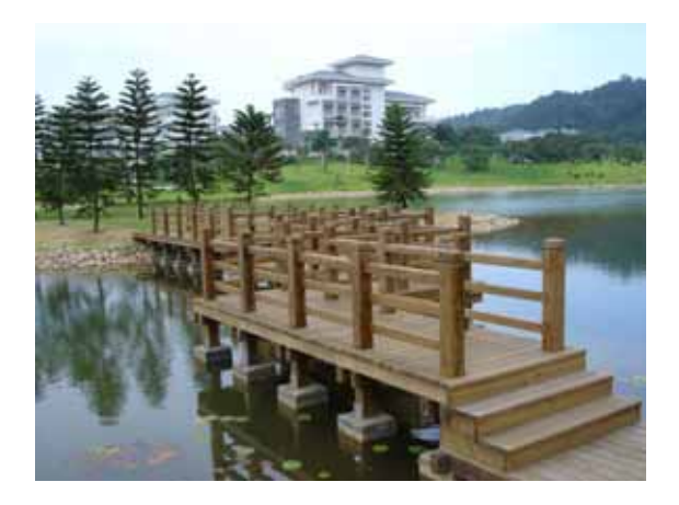
Conference Centre, Nanning

accommodation units around a lake in a landscaped park.