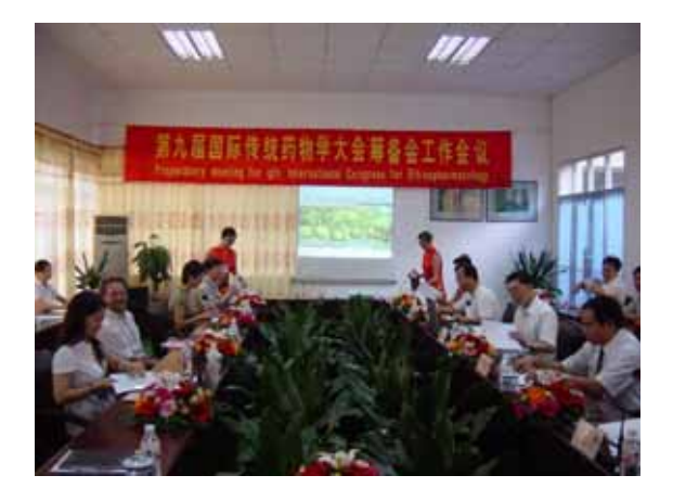
Working hard in the preparatory meeting

They were introduced to government officials of the region, as well as to academic and business people related to ethnopharmacology/natural products.